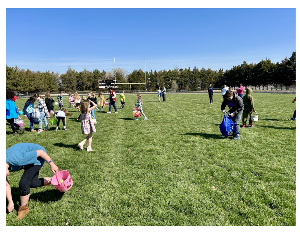
Kids looking for eggs