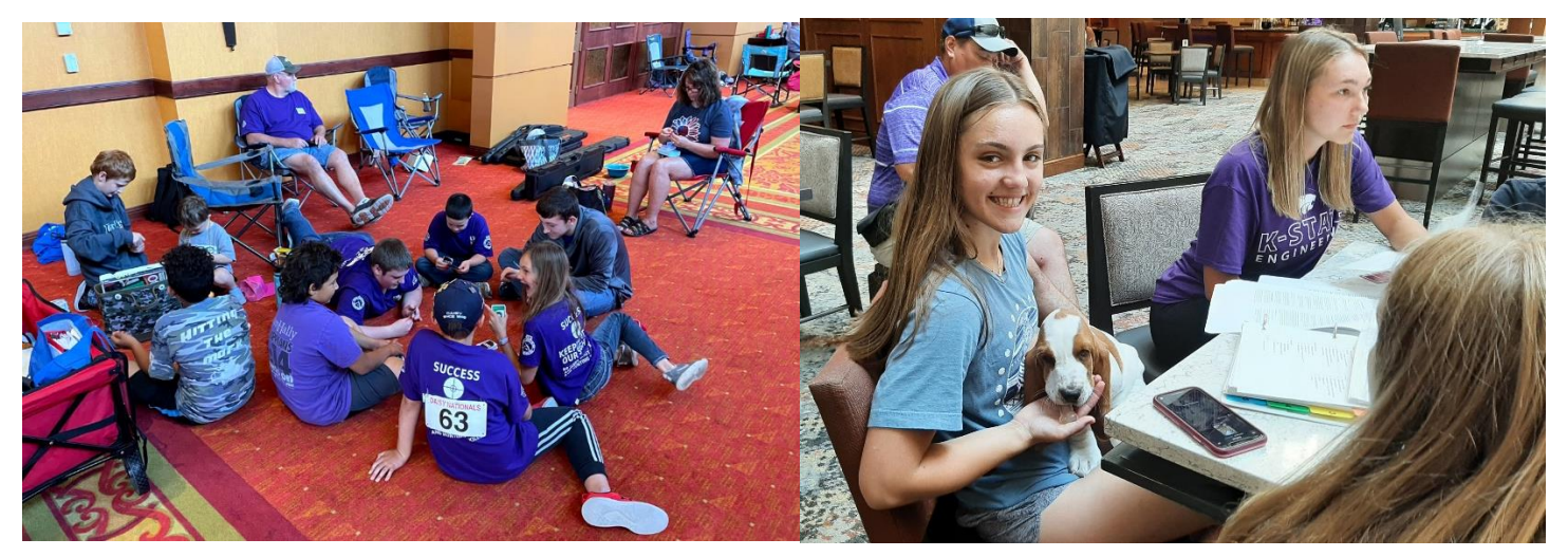
Competitors and family members "camp" in the hallway at Daisy Nationals.