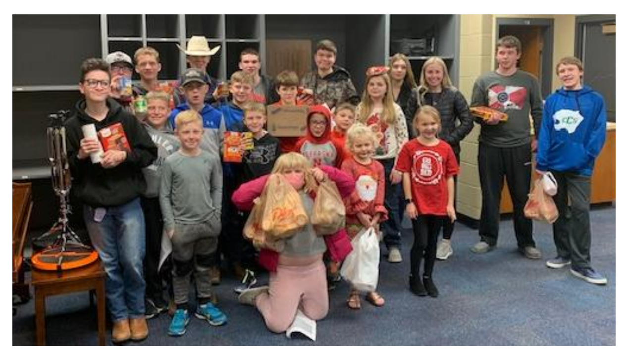
The Union Valley 4-Her's collected food for the food bank at their last meeting. Great job Union Valley 4-H Club.